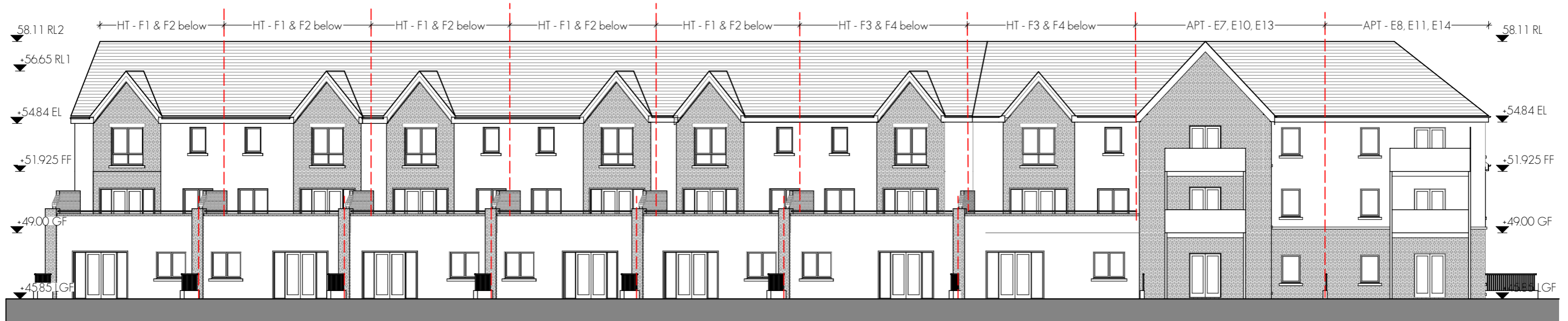
CONTEXTUAL REAR ELEVATION (NORTH EAST) - OVERLOOKING GREENWAY 1:200